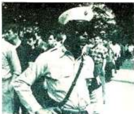
Nigger M. P. looking for trouble, and he finds it, as Valiant 87, trouble for Race-mixers, march.

Tall and proud they marched, thin in numbers, but mighty in spirit, like the few early Christians who rose to shatter an empire and build another.