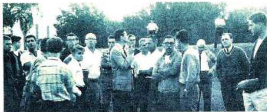
A special award has been bestowed on all among Valiant 87.

Cmdr. blasts Race-mixing to pretty blonde reporter, while gesturing to vile example of it at right.