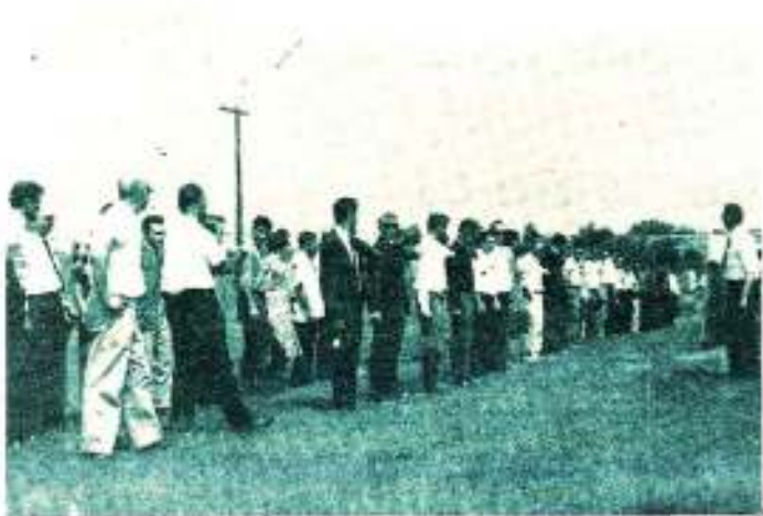
Time to act! Banned from demonstrating, Cmdr. snaps up Valiant 87 for Nazi "Snake Dance" line.