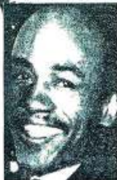
One of Christine's nigger boy friends, 'Lucky' Gordon.

LONDON, England--A greedy Jewish slum-lord was discovered to have been footing much of the bills in the shameful sex scandal which recently shook the entire British Empire. Peter Rachman, a Jewish refugee from Poland, was discovered to have been the one who introduced 18 year-