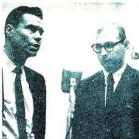
The Commander being interviewed over radio station WDMS, Lynchburg, Va.

Young autograph seekers flock around The Commander. To them he represents the symbol of their future.