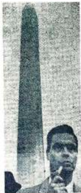
Monument to man who won our nation flanks figure of man who will now save it.