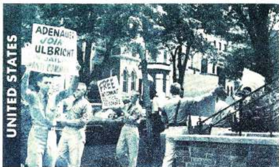
American Nazis picket German Embassy in Washington. Other members picketed German Consulate in New York.