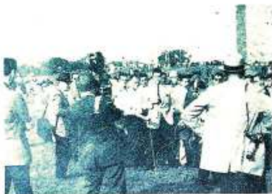
Scores of newsmen flock around Cmdr. and Valiant 87, lone protectors of White Race

It was August 28, 1963, Washington, D. C. The Niggers and Jew-Communists massed by the tens of thousands for the first testing blow of revolution. But the White people and the Right-Wing had evacuated their nation's capital in fear. The lone protectors of the White Race were the Valiant 87 of the American Nazi Party. And the world will never forget their heroism.